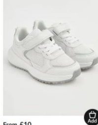
From £10 White Mesh Single Strap Trainers

We appreciate that non-branded trainers are not always available in sports shops and can be difficult to source once feet start getting larger. Therefore, branded trainers for PE are permitted so long as they are plain black or white or have a discreet logo. Here are some examples of acceptable branded trainers.