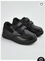
From £18 Black Leather Double Strap School Shoes