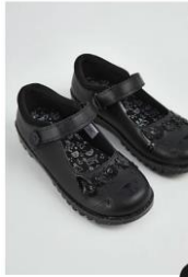
From £15 Black Floral Cat Mary Jane School Shoes