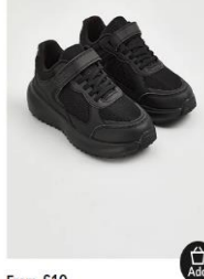
From £10 Black Mesh Single Strap Trainers